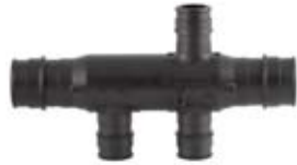
3/4" EP Flow-through Opposing-port Multi-port Tee, 3 outlets (Q2337557)