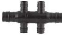
3/4" EP Flow-through Opposing-port Multi-port Tee, 4 outlets (Q2347557)