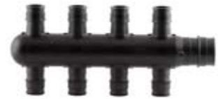
3/4" EP Branch Opposing-port Multi-port Tee, 8 outlets (Q2387550)