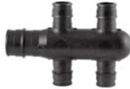
3/4" EP Branch Opposing-port Multi-port Tee, 4 outlets (Q2347550)