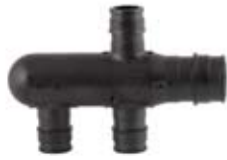
3/4" EP Branch Opposing-port Multi-port Tee, 3 outlets (Q2337550)