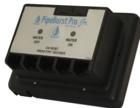
FloTrol Remote Control Switch

ABOUT OUR WARRANTY: Quite simply the best protection on the market. We feature a 7 year limited warranty that emphasizes our quality and premium features.