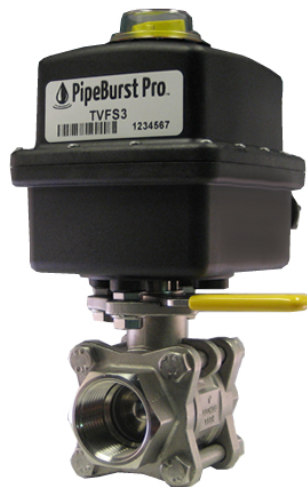
1" Stainless Steel TickerValve with Actuator Attached

Our TickerValve also comes equipped with a Manual Override Handle; thus providing fail-safe access to control the valve manually, if required, for any peculiar reason. Its' ¼ turn handle is simple to use and highly visible (bright yellow in color) for quick access.