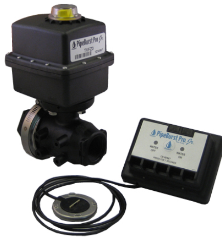
PipeBurst Pro Jr. – 1" Zylon TickerValve, VIP Jr. and SideKick

The patent pending PipeBurst Pro Jr. is a new and revolutionary professional grade system that provides rapid domestic flood protection. PipeBurst Pro Jr. combines a unique design using high tech sensors and proprietary control components which offer flexibility, proven dependability and lasting value. The PipeBurst Pro Jr. responds early and gives positive action to prevent costly water damage losses such as hidden mold, ruined flooring, loss of photos and other valuables that cannot be replaced. Quick delivery and easy installation means your PipeBurst Pro Jr. can be protecting your business, home and family with the peace of mind they deserve.