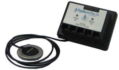
VIP Jr. with Attached SideKick

ABOUT THE FLOTROL: The FloTrol is an optional hardwired remote control switch used to operate the TickerValve. It basically displays the functions that the VIP Jr. sends to it via a lighted LED.