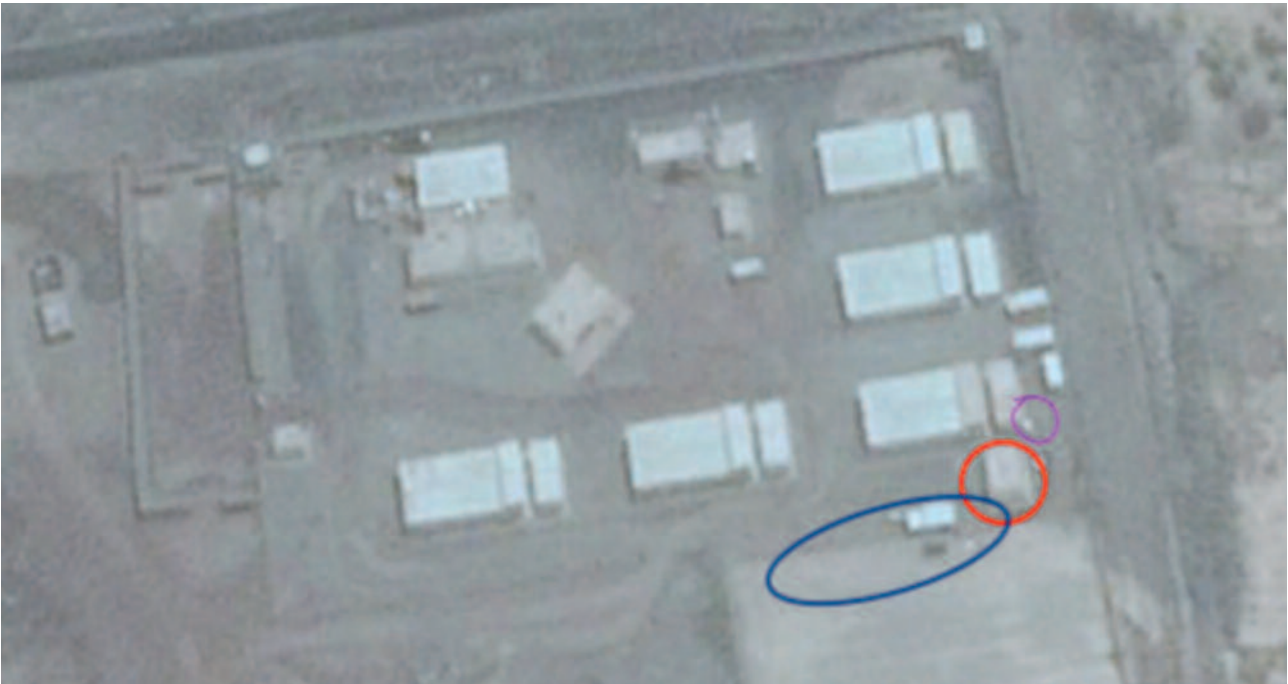
Localisation présumée de la « prison secrète » sur le site de Yemen LNG à Balhaf