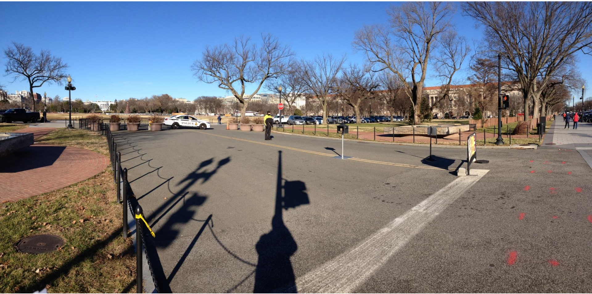
View looking north at 16 th & Constitution entrance