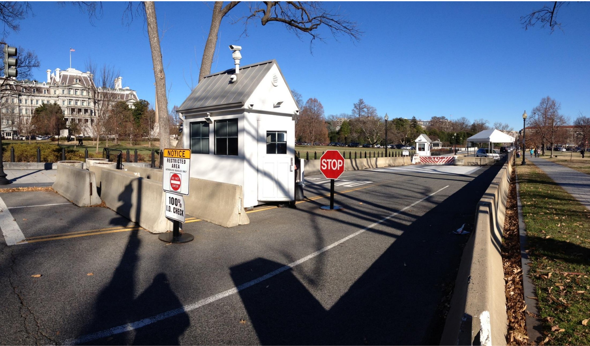
View looking northeast at 17 th & E entrance