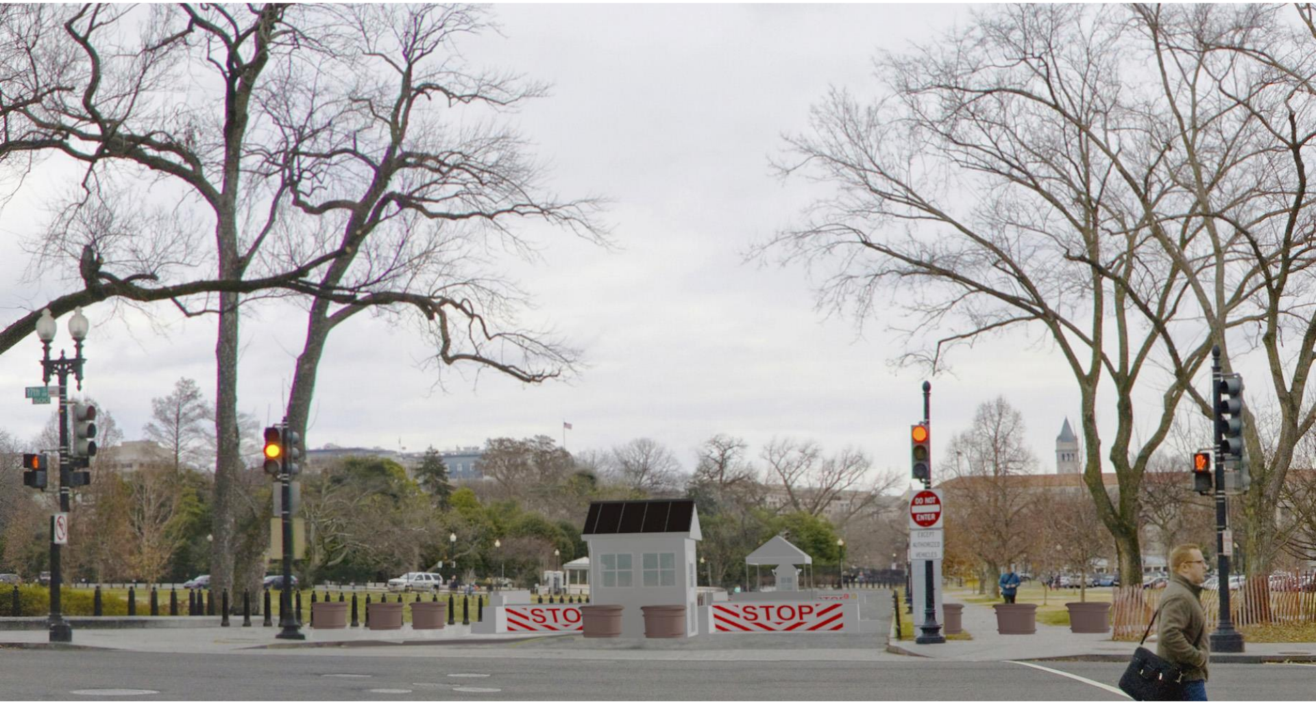
Rendering of improvements