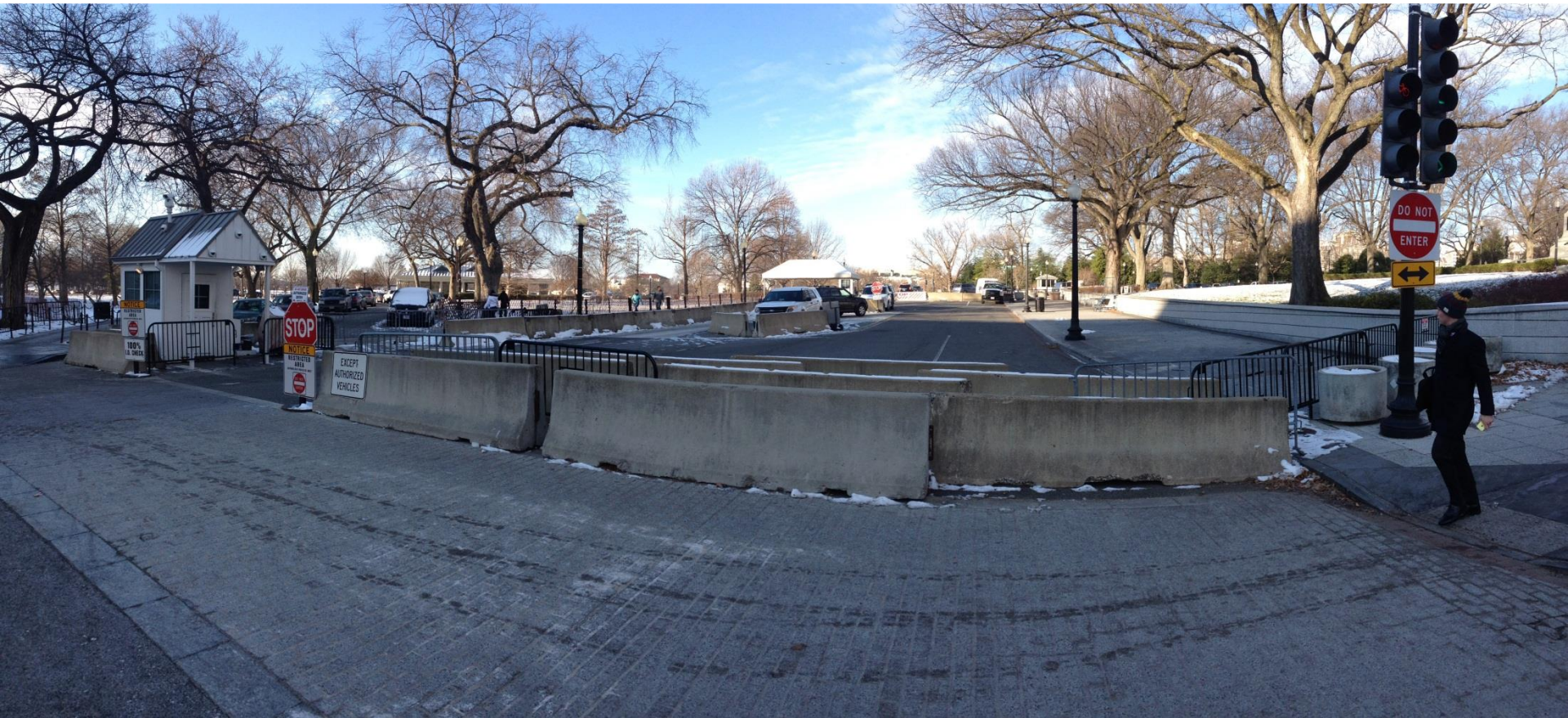
View looking west at 15 th & E Street entrance