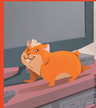
The pet Morph