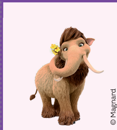
The daughter Peaches