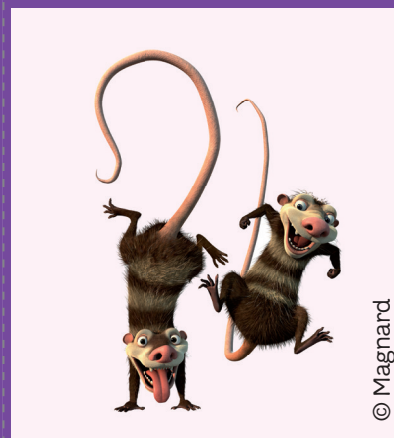
The twins Crash & Eddy