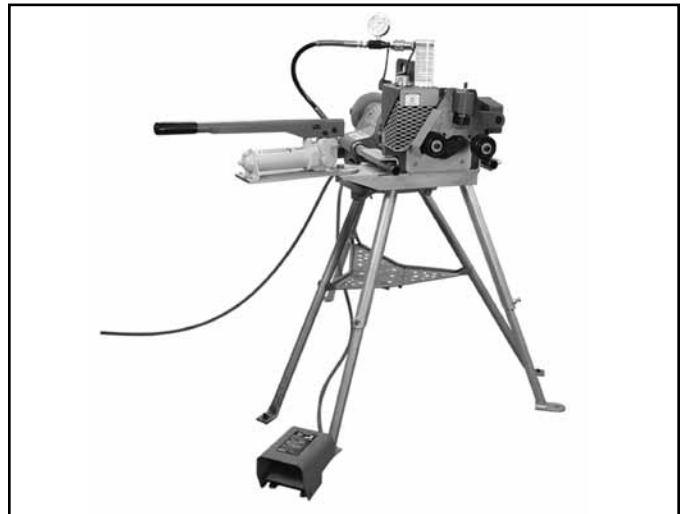
MODEL 3007 ROLL GROOVERS