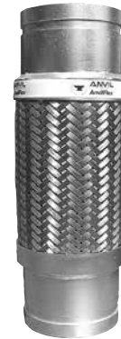
Groove x Groove Proper Installation

2 During system shutdown braided metal hose assembly should be examined to verify no thermal axial motion has occurred causing compression of the assembly.