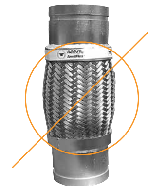
Groove x Groove Improper Installation Compressed