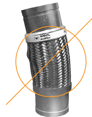
Groove x Groove Improper Installation Parallel