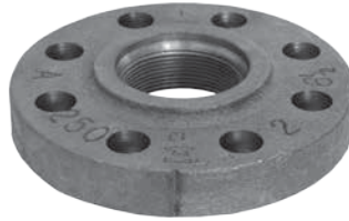
FIGURE 1025 Companion Flange