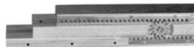
B Pedestal Type