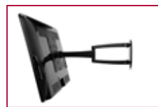
\pm 15^\circ of viewing angle adjustment