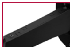
Internal Cable Management