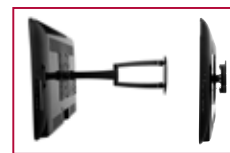
Arm retracts to just 2.50" (64mm) and extends up to 21.26" (540mm) from the wall