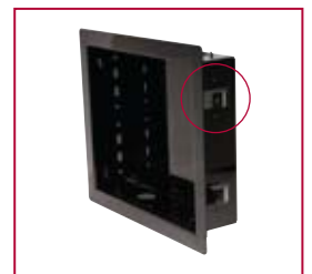
Stud locating tabs