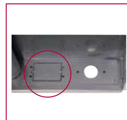
Removeable outlet receptacle

Integrated cable management provides ample space to run cables