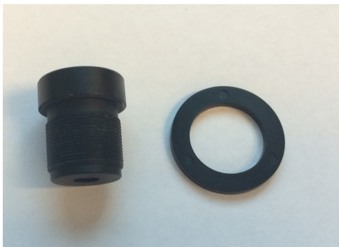
The package will include the actual lens and a Nylon ring shown above.

Please take care not to touch the glass parts on the lenses after removing the protective coverings.