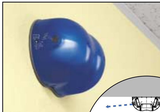
SW99-2032 — your double view camera for corridors

True Blue Beacon —You'll deter would-be perpetrators while reassuring employees and guests. The "true blue" LED, says Spyder is recording for you.