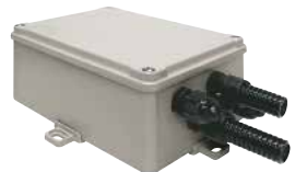
WEATHERPROOF JUNCTION BOX