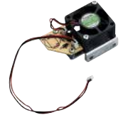
BLOWER WITH AIR FILTER