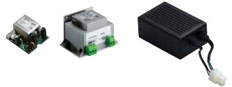
CAMERA POWER SUPPLY