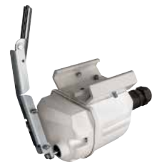
WIPER FOR HEG