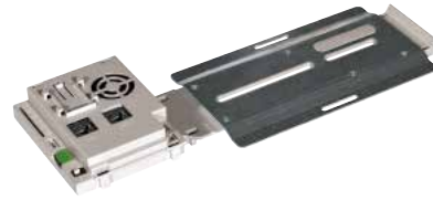
HI-POE IPM (INTELLIGENT POWER MANAGEMENT) MODULE