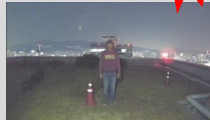
Dark Hunter (Full HD, 30fps)