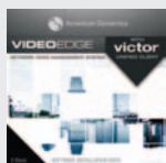
VideoEdge NVRs and Hybrid