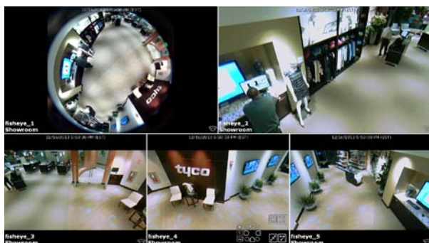
Illustra 825 Fisheye video stream views in victor/VideoEdge 4.4

* Includes double gang box/mount adapter plate