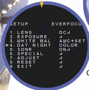
OSD Menu setup locally or remotely via RS-485