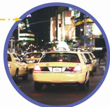
True Day/Night or Color in Low Light