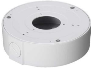
MNT-JUNCTION BOX 1