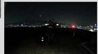
Normal Camera (Full HD, 30fps)