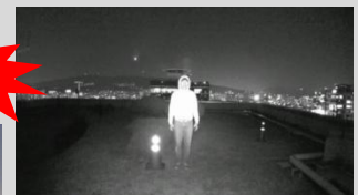
IR Camera (Full HD, 30fps)