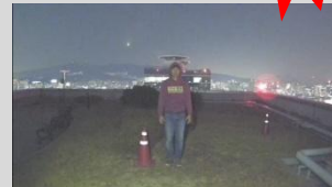
Dark Hunter (Full HD, 30fps)