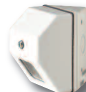
OPTIONAL CORNER MOUNT ADAPTER

Our board cameras are now available preinstalled as a kit in our BH-1 Series Housing, B/W or Color options with 2.5 or 6mm fixed iris lens. All camera options include backlight compensation and auto electronic shutter for indoor or outdoor use. Wall, ceiling, or corner mount with optional bracket. The BH-1 is weather-sealed aluminum housing with 3/16" polycarbonate window and tamperproof key lock. Mounting hardware and BNC connector included.