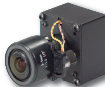
Optional Housing EM2-H (accepts both fixed & varifocal lenses)