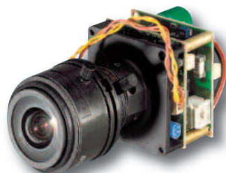
AUTO-IRIS VARIFOCAL LENS