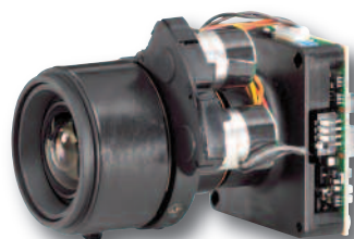
D/N AUTO-IRIS VARIFOCAL LENS