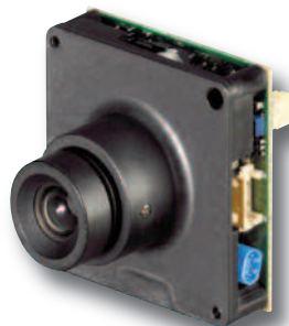
STANDARD FIXED LENS