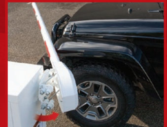
Breakaway Arm Option reduce maintenance costs