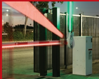
Octagonal Lighted Signal Arm light the way for customers to exit easily and safely with signals and sensors