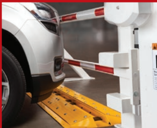
Lane Barrier surface mount accessory