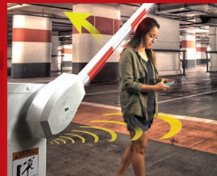
DKS Loop Logic it's aware - even when they're not