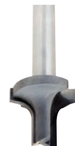
40-50 Series Two Flute - Carbide Tipped Lettering Bits Product Offering