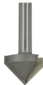
37-80 Series Two Flute - Carbide Tipped Lettering Bits Product Offering