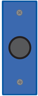
#425B-BLK (Blue Powder Coat Face Plate, Black Button Switch)