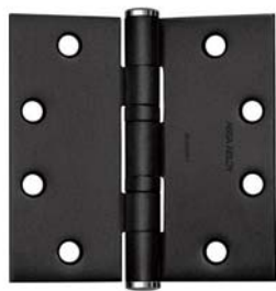
Five Knuckle Hinge, Button Tips Shown - Black powder coat hinge Satin chrome tips