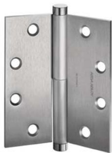
Two Knuckle Hinge, Flat Tips Shown - Satin chrome hinge Bright chrome tips

Mix it up a bit! Combine bright with satin, or light with dark, and create that extra bit of drama for your opening. The McKinney split finish offering allows you to customize your hinge to complement any building interior.