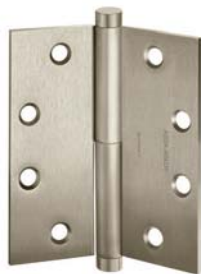
The cleanest of all hinge types. The two knuckle hinge is simple yet sophisticated.

It's all about details, details, details. Even the smallest accessories matter. Dress up your hinge by adding decorative tips to enhance your design. Available for the two or three knuckle hinge, in flat, round, grooved or lined, these tips will give the finishing touches to your decorative suite.