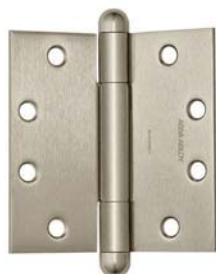
Reliable and classy. The three knuckle hinge provides that little extra detail.