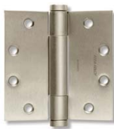
Strength and beauty. The heavy weight three knuckle hinge commands attention.