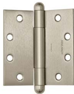
Three Knuckle Hinge, Round Tips Shown - Satin nickel hinge Satin nickel tips