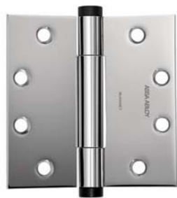
Three Knuckle Hinge, Flat Tips Shown - Bright chrome hinge Black powder coat tips