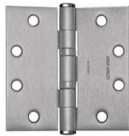
Five Knuckle Hinge, Button Tips Shown - Satin chrome hinge Bright chrome tips