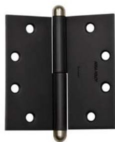
Two Knuckle Hinge, Round Tips Shown - Black powder coat hinge Satin nickel tips