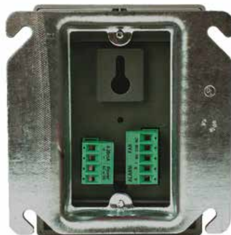
TX-6-ND Rear View