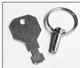
UNIVERSAL TURN RING AND KEY LOCK INCLUDED

CSFM: This product has been approved by the California State Fire Marshall (CSFM) pursuant to Section 13144.1 of the California Health and Safety Code. See CSFM Listing No 3330-1223:101 for allowable values and/or conditions for use concerning material presented in this document. It is subject reexamination, revision and possible cancellation.