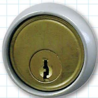
CylGard™ No. CG1-AXC-EA 1.73" O.D. x 1.165" I.D. (44 x 30mm) Satin Stainless Finish

The HPC/Scotsman CylGard™ is a case hardened solid steel ring designed to guard against forcible entry. It spins freely around the cylinder, preventing the use of a wrench to break the cylinder. It has a satin stainless finish, providing an extremely durable and attractive look.