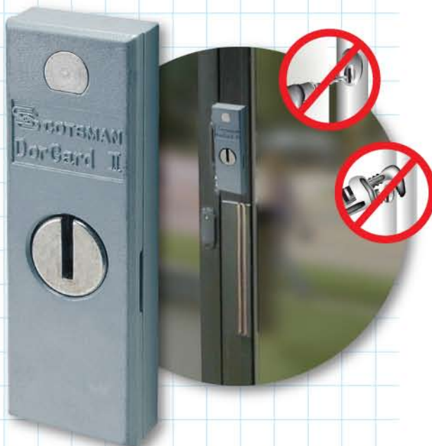
DorGard II™ No. DG2-AXS-10

The DorGard II™ provides unsurpassed protection for lock cylinders on narrow stile aluminum doors. Using cast steel components, it creates a "vault" around the cylinder, virtually eliminating the possibility of unauthorized entry by removal of the cylinder or cylinder plug. The face plate is cast stainless steel, protecting against all common drilling equipment. The plug protector is made of case hardened steel. It rotates freely in the face plate, protecting against forcible removal of the plug. The DG2 is affixed with hardened steel bolts through the door. The unique construction provides easy installation and easy access (without removing the door guard) for servicing the cylinder. DorGard II™ can be used with any cylinders from 15/16" to 1-3/8" (2.38 to 3.50cm) in length. Satin stainless finish.