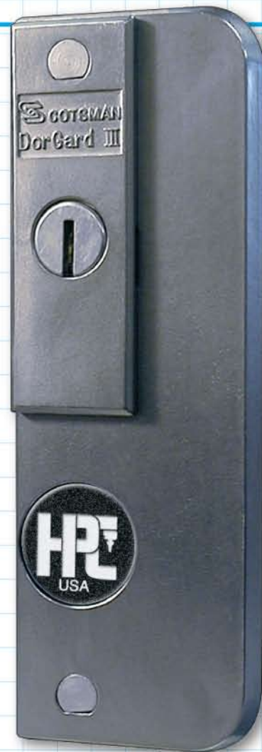
DorGard III™ No. DG3-APS-10