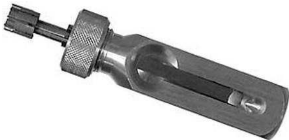
Guard No. TLP-GUARD