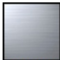
US28 Clear Anodized Aluminum