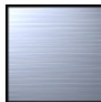
US26D Satin Chrome