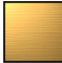
US10 Satin Bronze