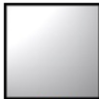
US32 Polished Stainless Steel