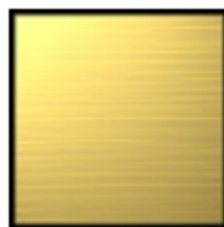
US4 Satin Brass