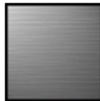
US32D Satin Stainless Steel