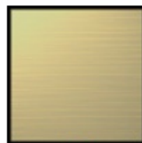
US5 Antique Brass