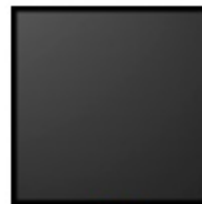
315 Black Anodized Aluminum