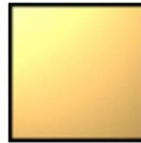
US9 Polished Bronze