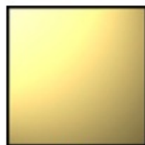
US3 Polished Brass

Due to different color settings on individual computer monitors, these sample colors may not reflect the exact finished product.