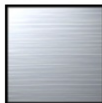
US15 Satin Nickel