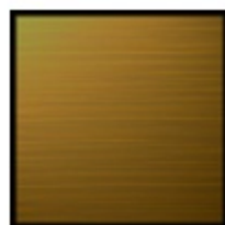
US10B Oil Rubbed Bronze