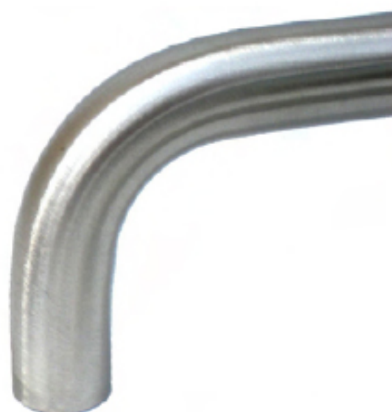
1010/ 1020/ 1030