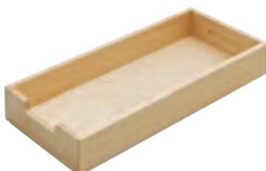
→ Full Size App Holder / Storage Tray, required