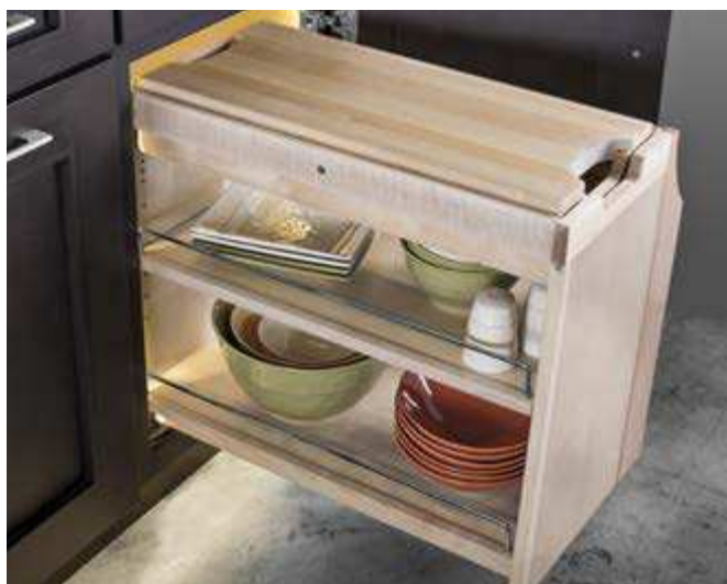
→ Base Pull-Out