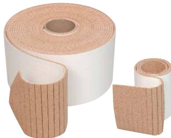
1,000 Pad Roll