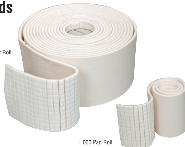
1,000 Pad Roll