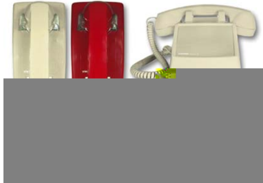
K-1500P-W Ash / Red