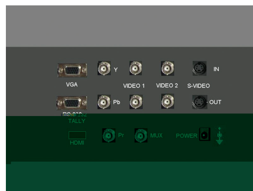
LCD-842HD (back view)