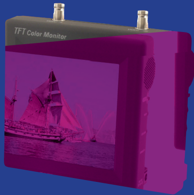
LCD-565 Unit with BNC IN/OUT (no audio)