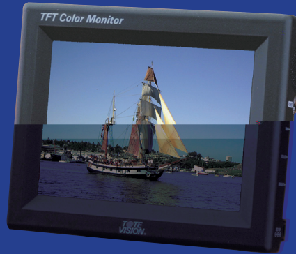
LCD-562 Unit with RCA Video and Audio