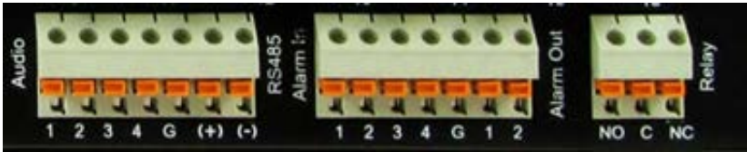
Audio/RS-485 Block Connections