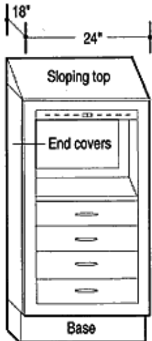
For surface mounting, add end covers, base and top