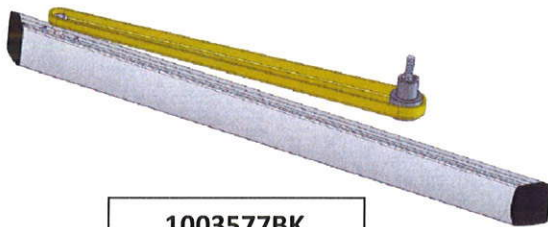
1003577BK (Pull Applications)

Two new operating arms are being introduced that will obsolete all previous arms for both the SW100 and Powerswing operators. The new “ Push ” application arm, and new “ Pull ” application arms have been redesigned such that they are now compatible with either operator. Although the arms are now the same, a new extension adapter will be required when used with the Powerswing Operator. No modifications needed.