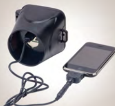
6986 USB Accessory Charging (phone not included)