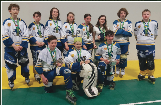
1-time U15 B League Champions (2023)