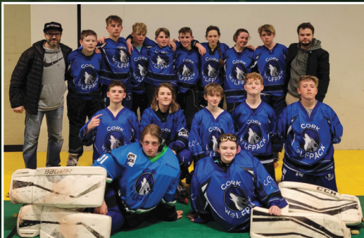
1-time U15 League Playoff Champions (2022)