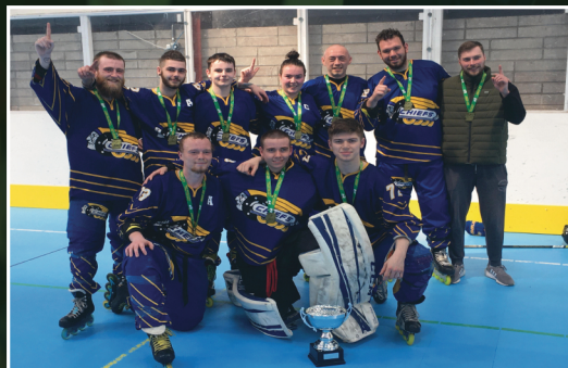
1-time League 2 North Champions (2023)