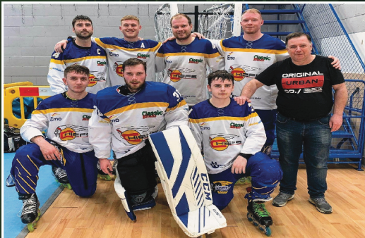
1-time League Cup Champions (2017)