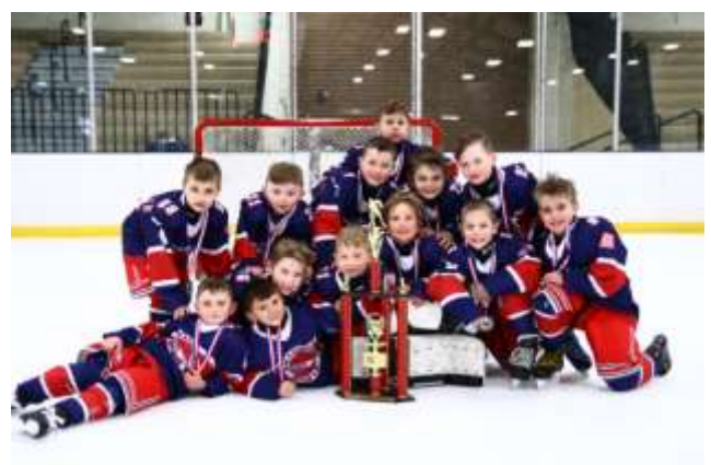
2011 Norris - 11 Waterford Hawks