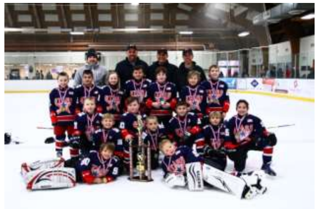
St.Clair 2 - Grosse Iles Stars