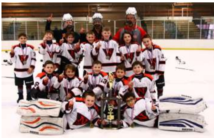
Tier 1 - 2010 Michigan North Stars – State/League Champions