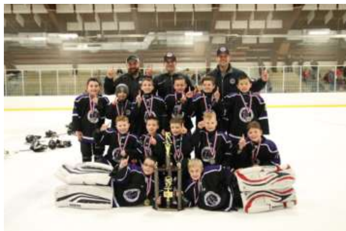
Michigan- Rochester Raptors– State/League Champions