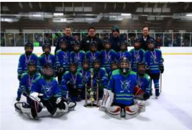
St.Clair 1 - Plymouth Whalers