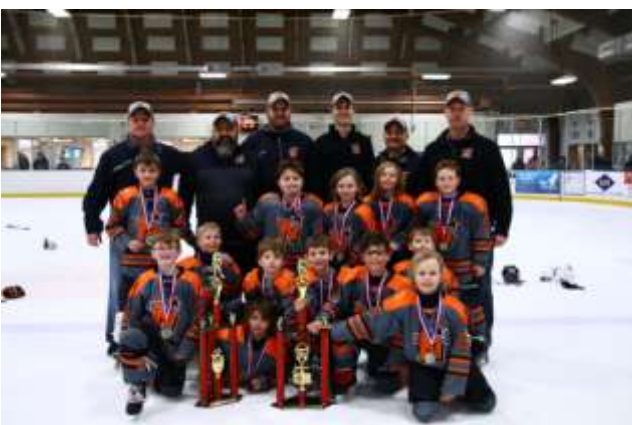
2011 Adams - 2011 Michigan North Stars - State/League Champions