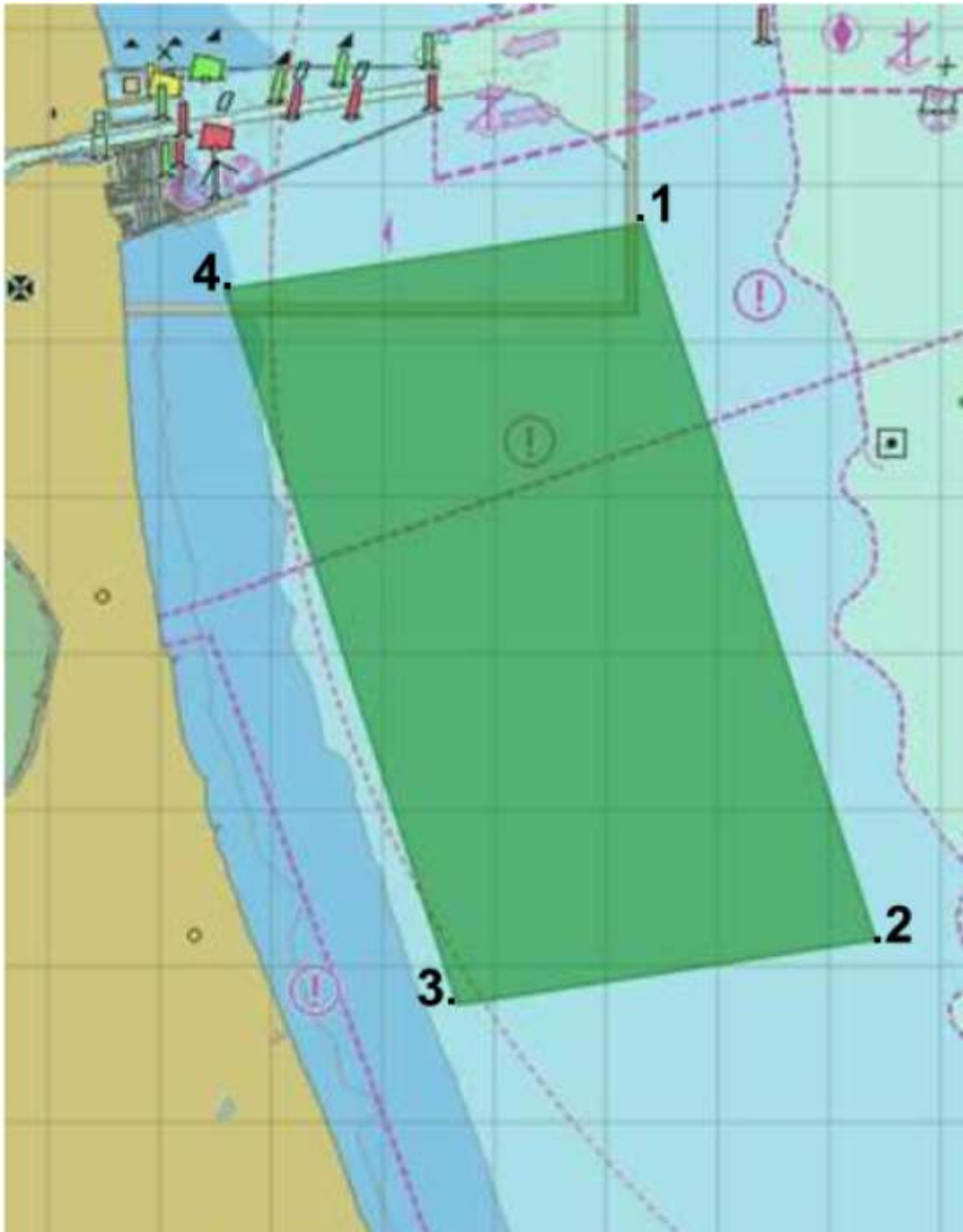
Figaro3 - Diam24 Marina di Ravenna - Venice Course TBD