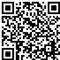
Official Notice Board

NOTICE: When submitting a protest, request or report, the procedure (as set forth in the Racing Rules of Sailing and the Sailing Instructions) remains unchanged.