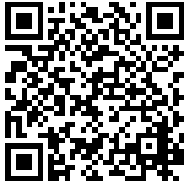
Submit Request for Hearing

Notice: This electronic notice board is the Official Notice Board (ONB) for this regatta.