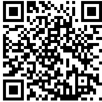
Submit Request for Hearing

Notice: This electronic notice board is the Official Notice Board (ONB) for this regatta.