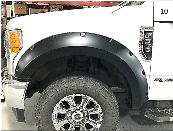
Completed Front Flare Installation.