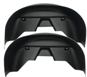
Driver Side & Passenger Side Liner 1 pr