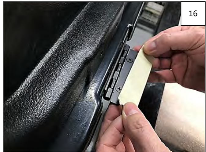
Place two supplied #10-24 Flat Head Screws through each Hinge on Bottom Box (four screws total). Place a piece of masking tape over screws to secure them.