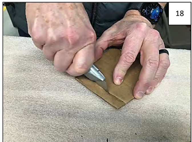
Cut two strips approximately 3" x 1/2" from the cardboard box the parts arrived in.