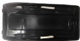
Cargo Box Bottom with Shocks, Hinges, and Lock Latch 1 pc