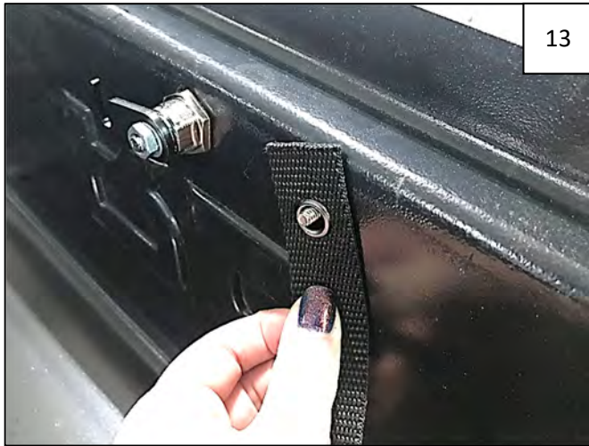
Slide the grommet of the Pull strap over backside of screw.