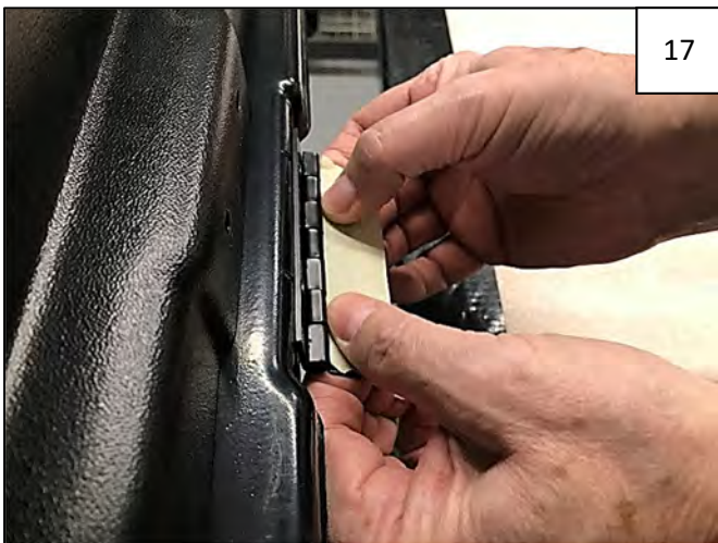
Press tape firmly to ensure screws remain flush with hinge.