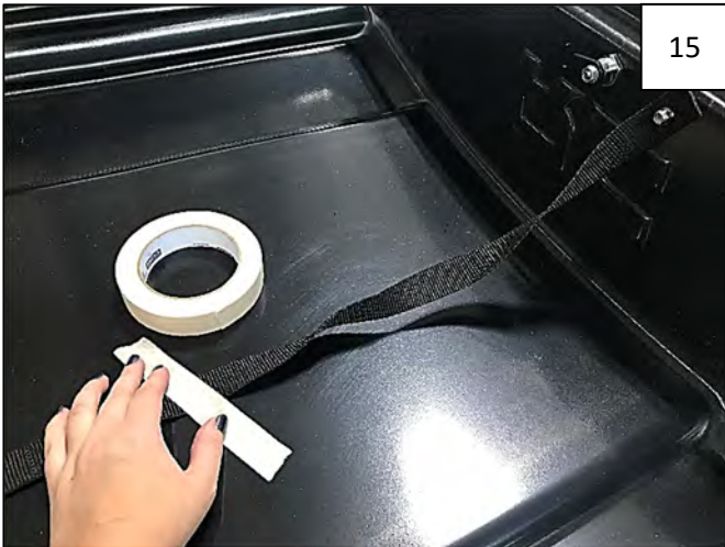
Use masking tape to secure the Pull Strap out of the way for the remainder of the assembly.