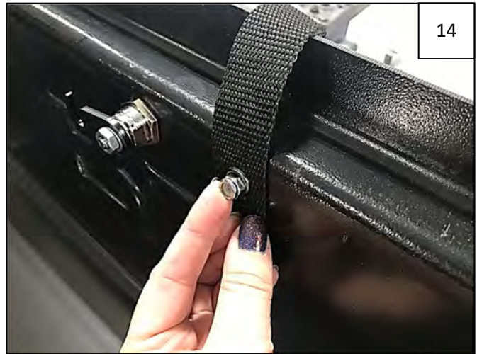
Install a supplied #10-24 Lock Washer over back of screw. Tighten with a 7/16" socket and a 1/8" hex key.