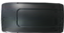
Cargo Box Top 1 pc