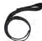
Pull Strap 1 pc