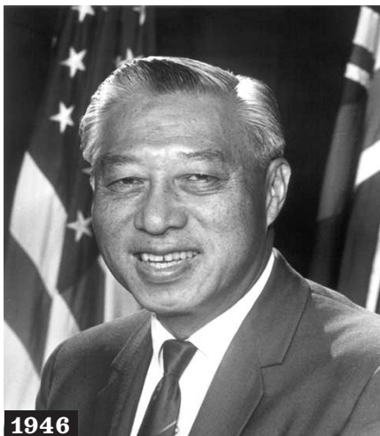
1946 Wing Ong, the first Asian American elected to state office