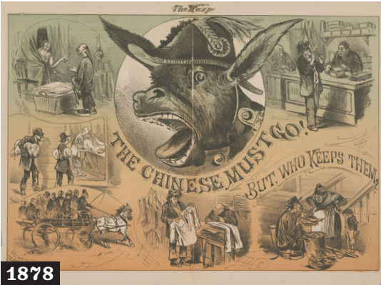
1878 Anti-Chinese political cartoon published in 1878 in retaliation against Chinese presence in California