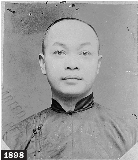
1898 Wong Kim Ark, who went all the way to the Supreme Court to fight a challenge to his citizenship