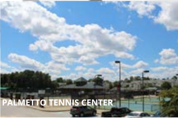
PALMETTO TENNIS CENTER

Riley Park is a newly-renovated 2,000-seat professional-quality stadium offering concessions and ample spectator space. The city of Sumter graciously allows USC Sumter to utilize the space along with the American Legion P-15's and Morris college baseball teams.