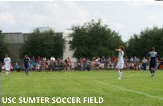
USC SUMTER SOCCER FIELD

Sumter's newest athletic facility, beautiful Patriot Park Sportsplex is built for tournament play with five baseball and softball fields and six soccer fields. It features an observation tower and fan-friendly covered spectator area. The city of Sumter generously offers use of the space during the softball season.