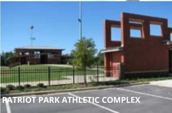
PATRIOT PARK ATHLETIC COMPLEX

The Palmetto Tennis Center is located inside Palmetto Park in Sumter. It boasts 24 state of the art tennis courts and is lit for night play with ample parking, restrooms and a pro shop. Both men's and women's tennis are fortunate enough to call the Center home thanks to the city of Sumter.