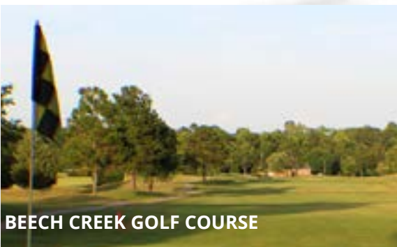
BEECH CREEK GOLF COURSE

The USC Sumter soccer field is located on the USC Sumter campus near the Student Union Building and Nettles Building. The field has been newly renovated and provides ample seating for guests and visitors. Concessions are available during home games.