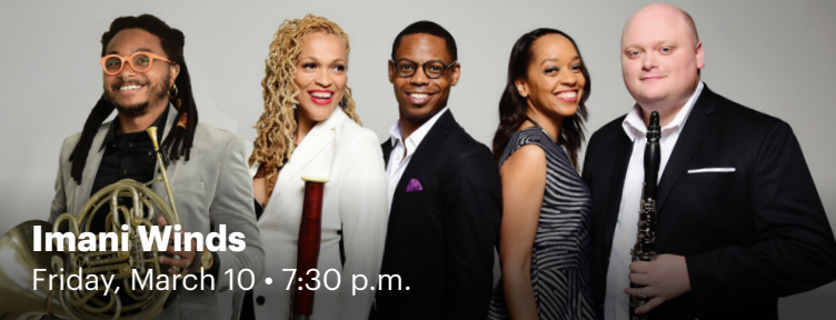
Imani Winds Friday, March 10 • 7:30 p.m.