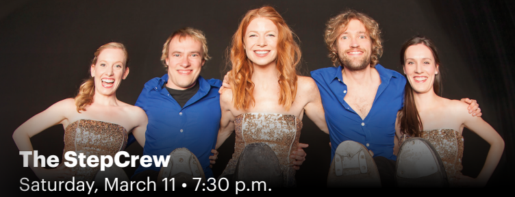
The StepCrew Saturday, March 11 • 7:30 p.m.