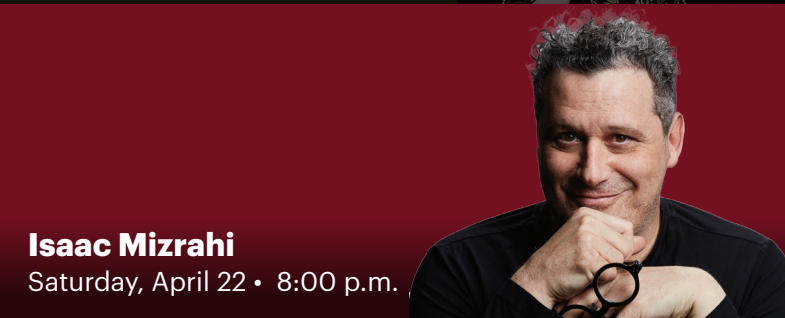
Isaac Mizrahi Saturday, April 22 • 8:00 p.m.